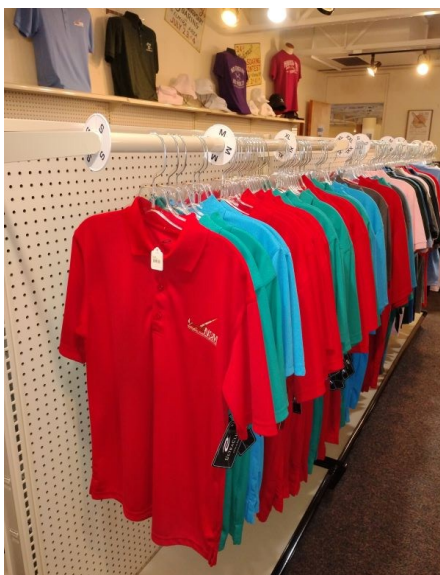
Hoodies, tee shirts, golf shirts and lots more!