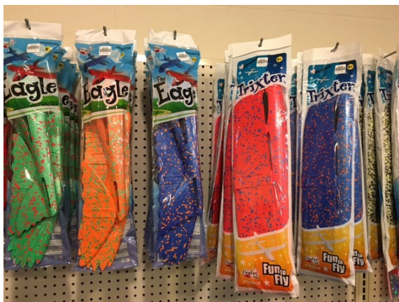
Gliders anyone can fly!