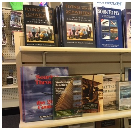
Books on soaring!