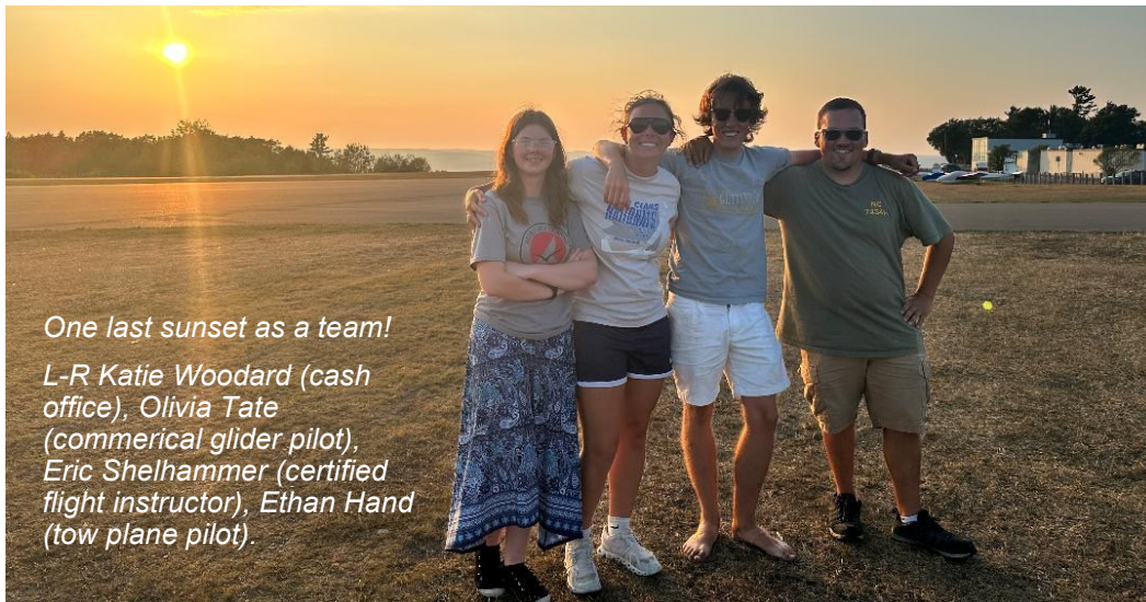
One last sunset as a team!