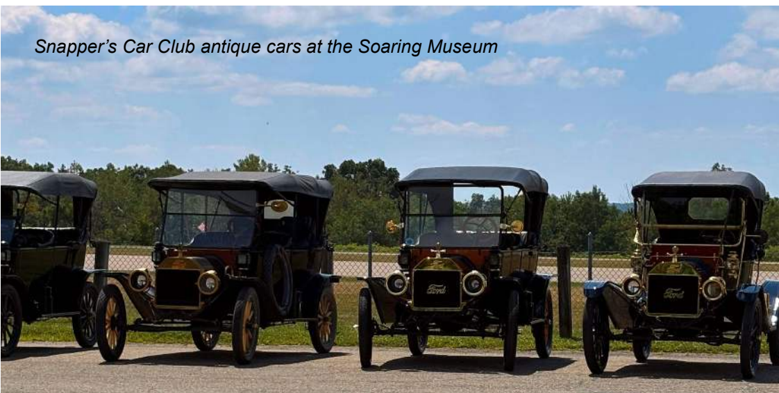
Snapper's Car Club antique cars at the Soaring Museum