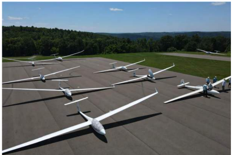
Ready for a fine day of competition!