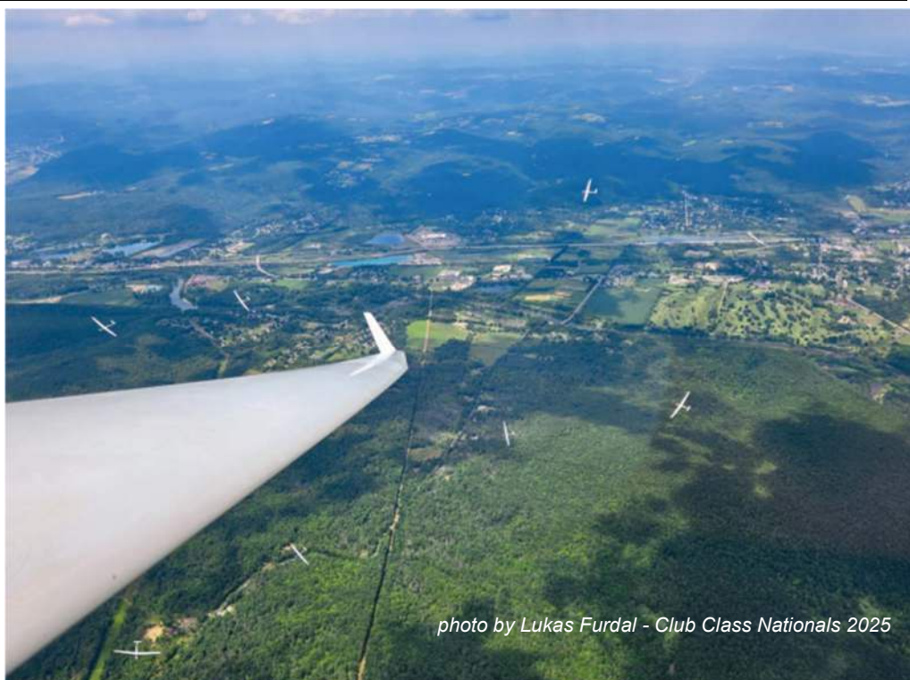
Club Class Nationals 2025

New Year's Day Easter Sunday Thanksgiving Day Christmas Eve Christmas Day