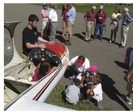
Children check out the Schweizer 2-32, a sailplane carrying "glider mail," after it landed at the Harris Hill Soaring Center on Friday afternoon.

Schweizer Aircraft Corporation has supported Chemung County and the surrounding area by providing safe, stable, and well paid jobs for thousands of employees over the years, and whereas the Schweizer name has always stood for integrity, fair