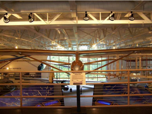
Display signs now mounted on stands, giving a more unobstructed view of the artifacts

I am working with the County on a proposal to substantially upgrade the museum lighting. They have in turn hired Labella Associates , a local engineering firm, to create a formal design. Our lighting "opportunities" are two-fold, consisting of corrosion/contact-related failures, and a wide range of lighting quality issues – we have areas that have never been adequately illuminated. This is going to be a big effort that will require County and State funding. For this reason, we are looking at fiscal year 2018 for this project. In the meantime, the County has been here regularly, catching up on burned-out bulbs. I am extremely appreciative for the excellent response that I have been receiving to my requests on a number of maintenance-related issues.