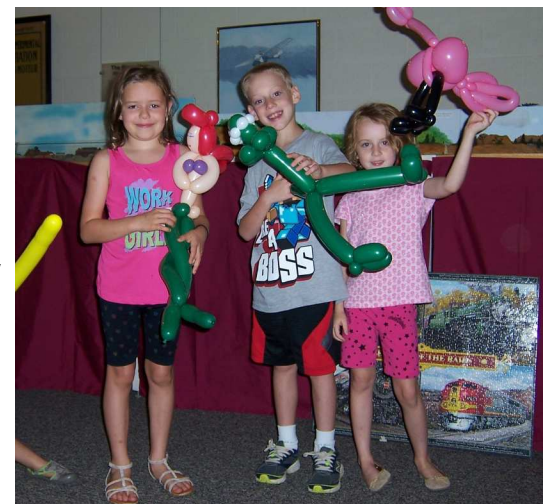
Balloon characters by Tim Cleary

for an early September day. Sailplane rides were offered and C-Tran gave rides over to Harris Hill Amusement Park.