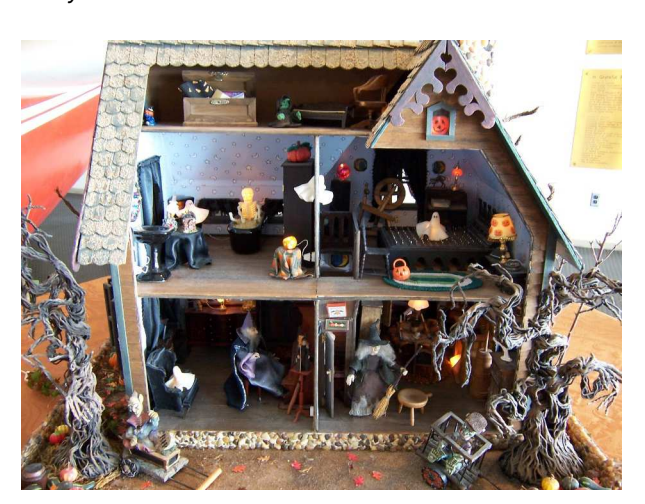
Pam Burton's famous Haunted House!