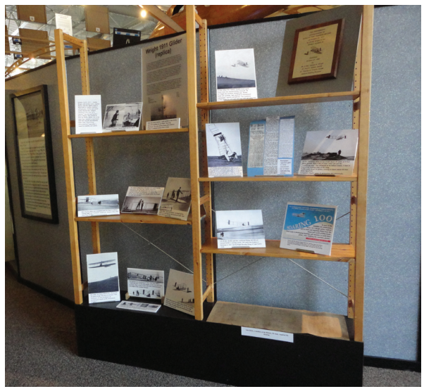
Soaring 100 Exhibit, now on display in the Johnson Gallery at the National Soaring Museum

Can't make it to North Carolina to join the celebration? Commemorate this incredible soaring anniversary with a visit to the National Soaring Museum! In the spirit of the Soaring 100 celebration, aviation historian Simine Short