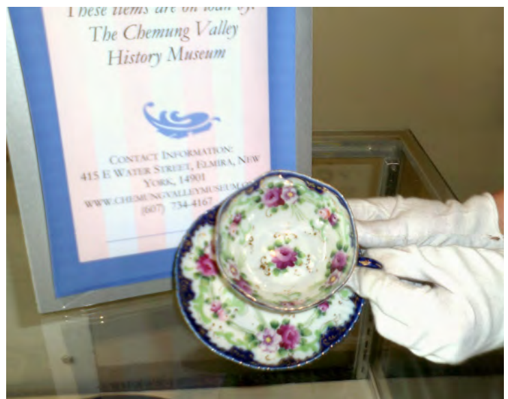
A tea cup used by Mark Twain when he stayed at Quarry Farm in Elmira. On display in the NSM lobby. On Loan from the Chemung Valley History Museum.

Some may argue that a soaring museum has no business either advertising other museums or displaying tea cups, but the truth is museums absolutely must work together so that all can have a better chance to survive. Cooperation is basic to survival among nonprofit organizations like ours, the Komen group and our neighboring museums. Reciprocity in exhibits, marketing, event promotion and fund raising is elementary to our future. It falls under the heading of "social capital," and while our balance sheets and audits may reflect the nature of the dollars-and-cents struggle that all museums face, we are working hard to improve the bottom line on our social capital balance sheet because we know that it already is paying off and will so even more in the future.