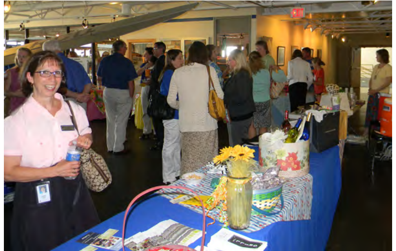
Corning Chamber members enjoying ice cream sundaes and root beer floats at the NSM's Business After Hours reception.