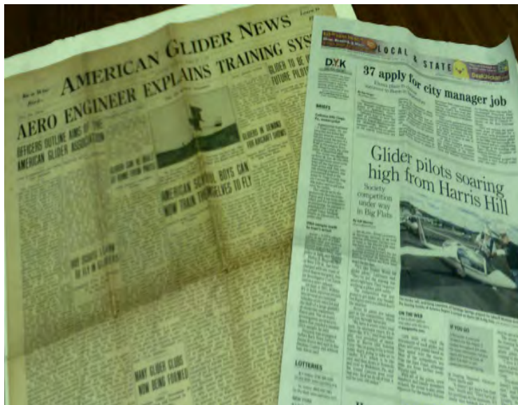
A rare 1929 American Glider News from Dearborn, MI greets a 2013 NY newspaper article about the Soaring Society of America Region 3 Contest at Harris Hill.

Lastly, thank you to all of NSM's Archives/Collection donors from decades past and decades to come!