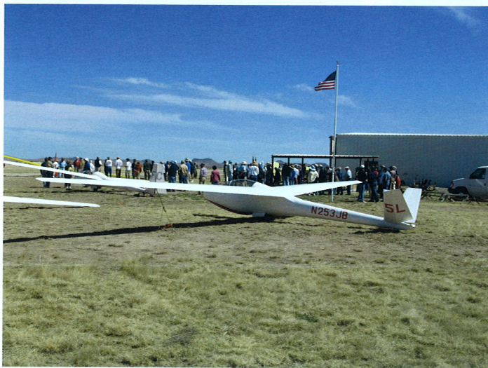
The crowd gathers for the landmark dedication ceremony.