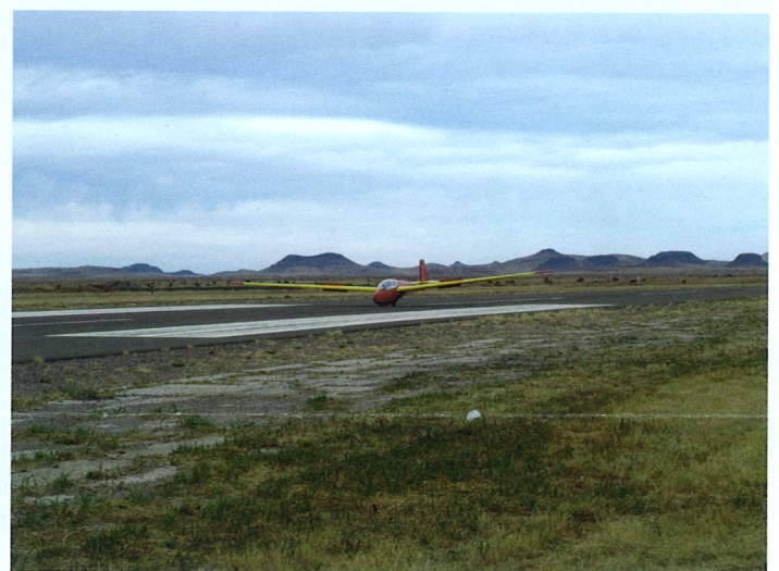
ASK-13 landing after mail flight.