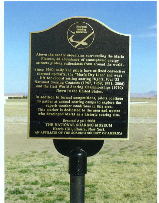
National Landmark of Soaring plaque #15.