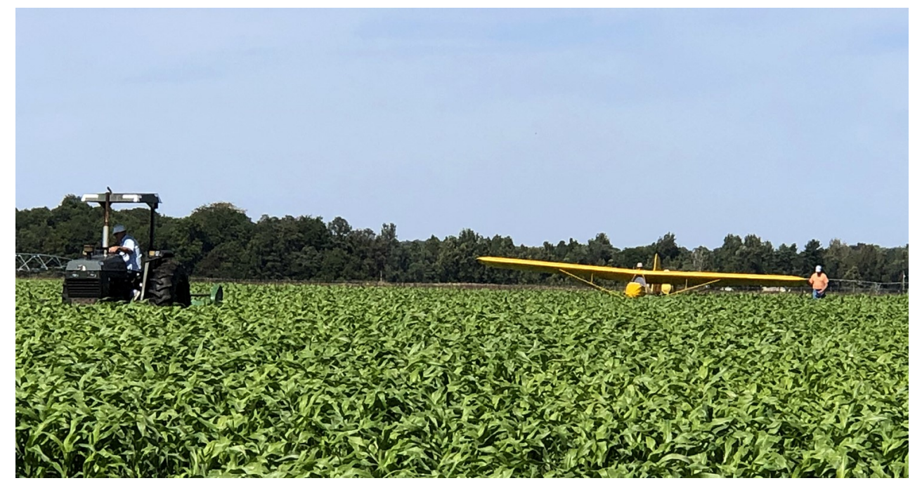
A slight miscalculation at Lawrenceville in the Schweizer 1-19. Fortunately, the airport had a big tractor!