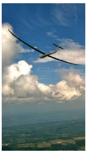
Moe Acee flies over Hammondsport

https://en.wikipedia.org/wiki/Milton_Bradley