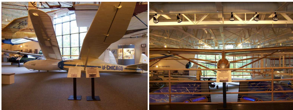
Display signs now mounted on stands, giving a more unobstructed view of the artifacts

Since assuming the position of Director in August, I have had no shortage of projects around the museum. My very first effort has been improving the museum display signs. I found the hanging display plaques and information panels to be difficult to read and they tended to obscure the view of the artifacts, and the museum in general . They were also a safety hazard – people ran into them constantly , and a few of them were in very poor condition. To correct these problems, I started with having the signs removed at the end of September. Most of the signs will be reused, either on new stands or mounted on walls. We will also make new signs as required. This project will be completed over the winter months.