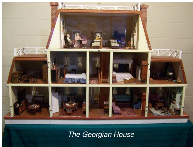
The Georgian House