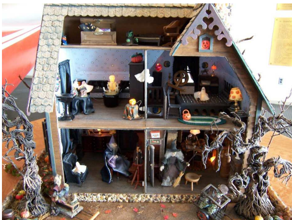
Pam Burton's famous Haunted House!