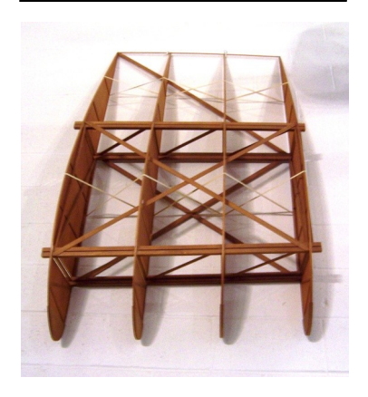
Bowlus SP-1 wing section