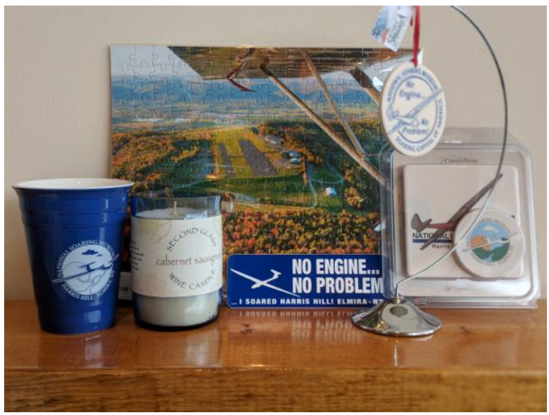
The newest NSM t-shirt, " No Engine No Problem ", has become so popular that the line has been expanded to include:

Short-sleeved Tees , colors: Denim Blue, Brick, Sea Foam Green. Sizes S-XL $22.99