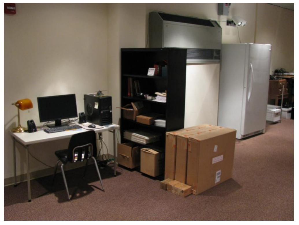
Photo at right shows Curren's work station on the left and the new freezer on the far right in the archives.