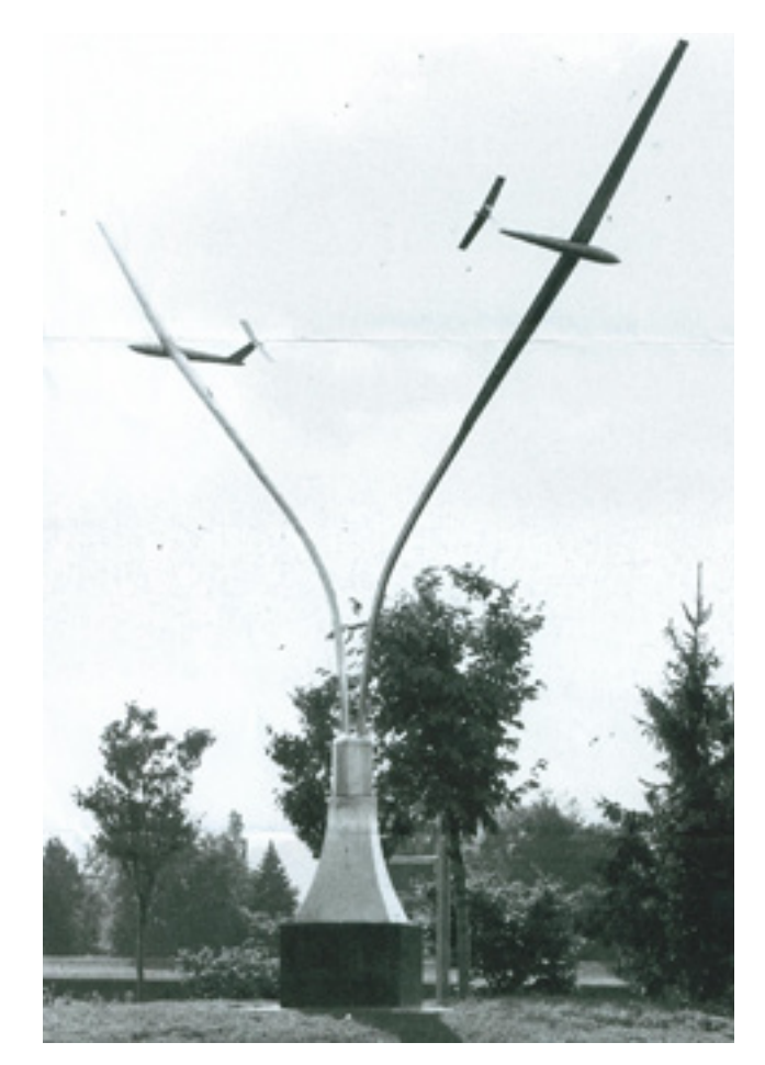
The Schweizer Sculpture

In the end the event returned some minor financial benefit to the museum itself, but also testified to the community's respect from one of the greatest names in its manufacturing history.