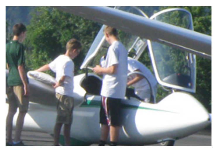
A camper prepares for his sailplane ride.