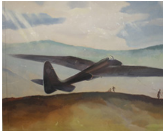
Detail from the “Mystery Mural”

why it was done, where it hung, and how it came to be in the museum. One tantalizing and regrettable item of fact is that the mural was one of two, the second of which is presumed lost. The second mural, in fact, clearly depicts gliding at Harris Hill, whereas the first cannot be so surely identified. It might show gliding in the early 1930s at other sites surrounding Elmira. One could argue that it more likely shows gliding at South Mountain, which overlooked Elmira from the south and which is about half way between Harris Hill and Sullivan’s Monument. In any event, there is a question about who commissioned the paintings. Throughout the 1930s, the Elmira Association of Commerce strongly encouraged and participated in the National soaring contests here, going so far as to offer cash prizes and even to buy a Rhonbussard of its own to fly (appropriately named, “Elmira”). A booklet entitled “Public Art in Elmira, NY” and probably published in either 1941 or 1942 shows the “mystery mural” as being on display in the Association of Commerce offices in downtown Elmira. (...story continued on page 4)