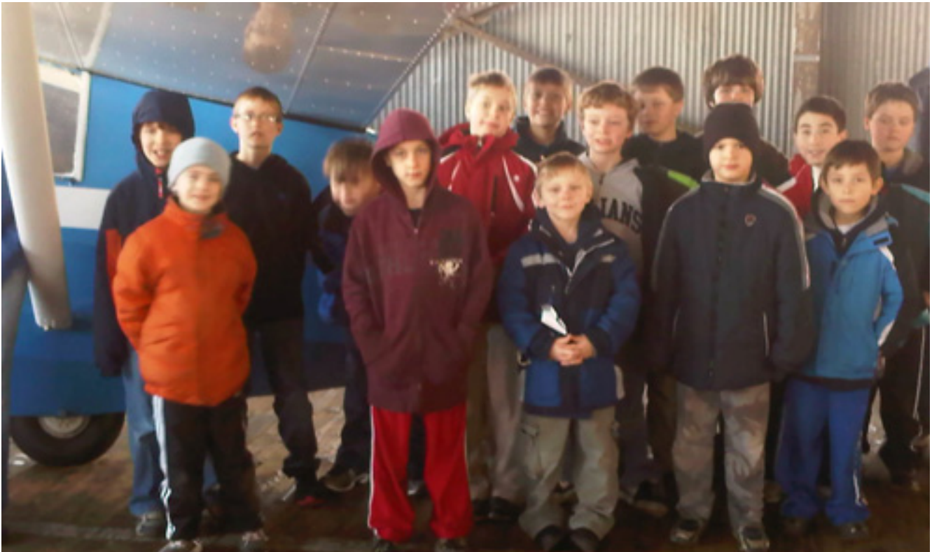
A group of Cub Scouts brave the cold on a tour of the Harris Hill Soaring Corporation's glider hangar.

The Eileen Collins Aerospace Camp is slated to begin July 7 - July 11 for boys and July 14- July 18 for girls. ■